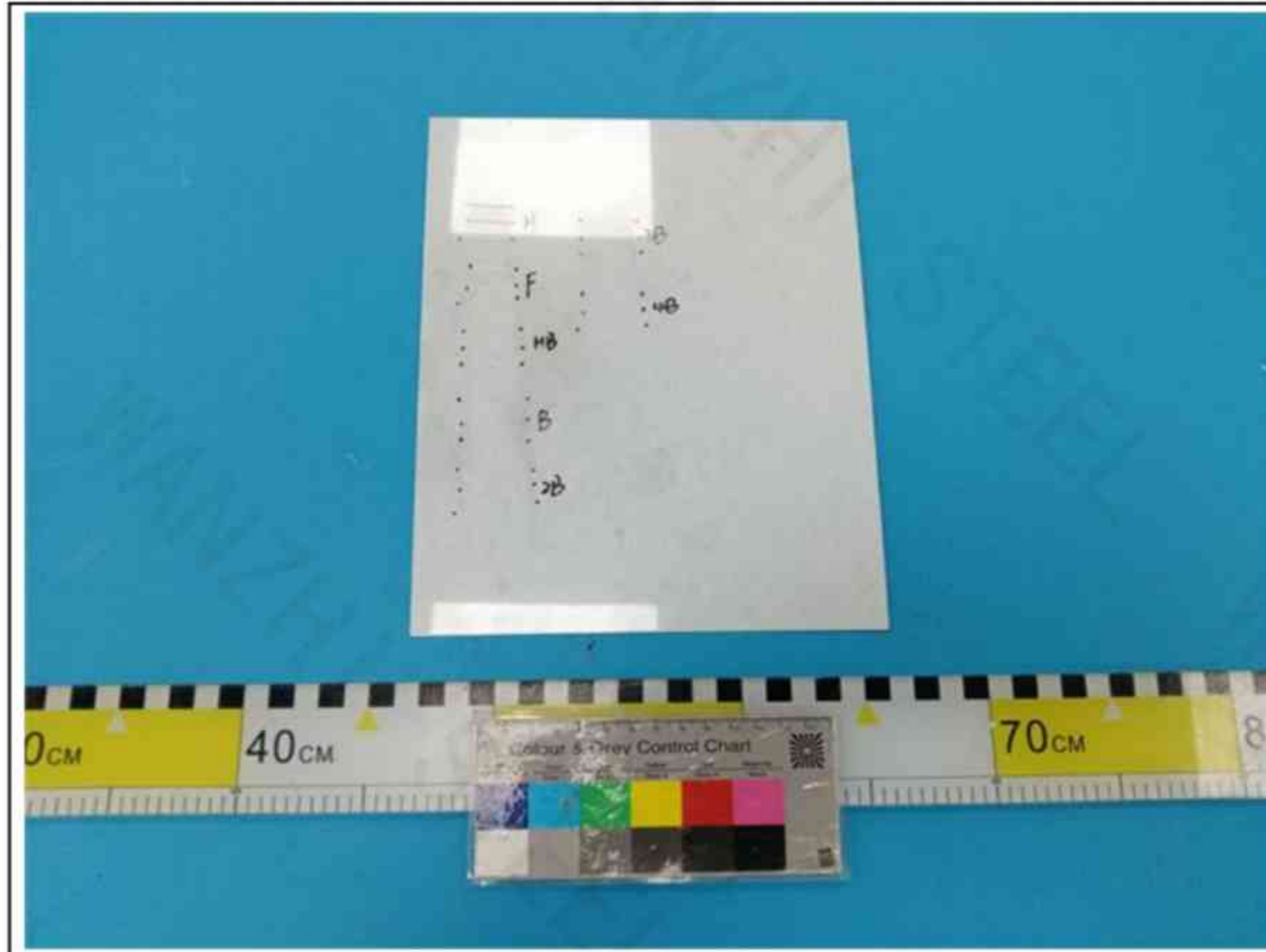
After Test-Sample A