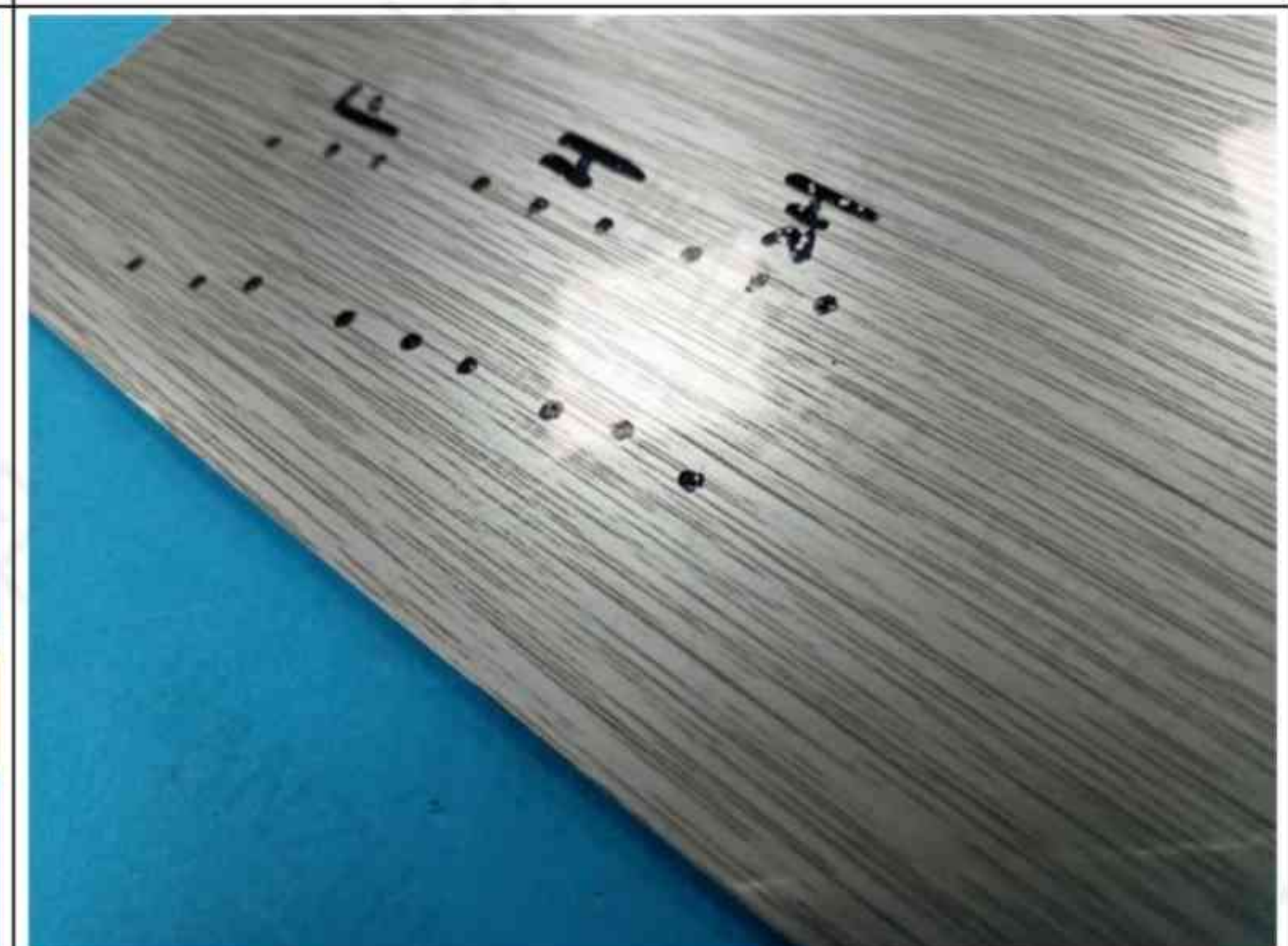
After Test-Sample C-Local part