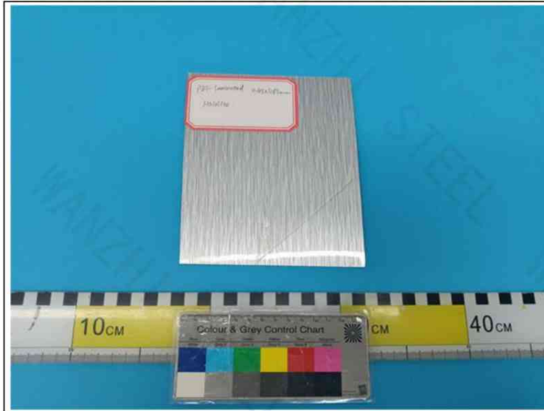
Original Sample-Sample C