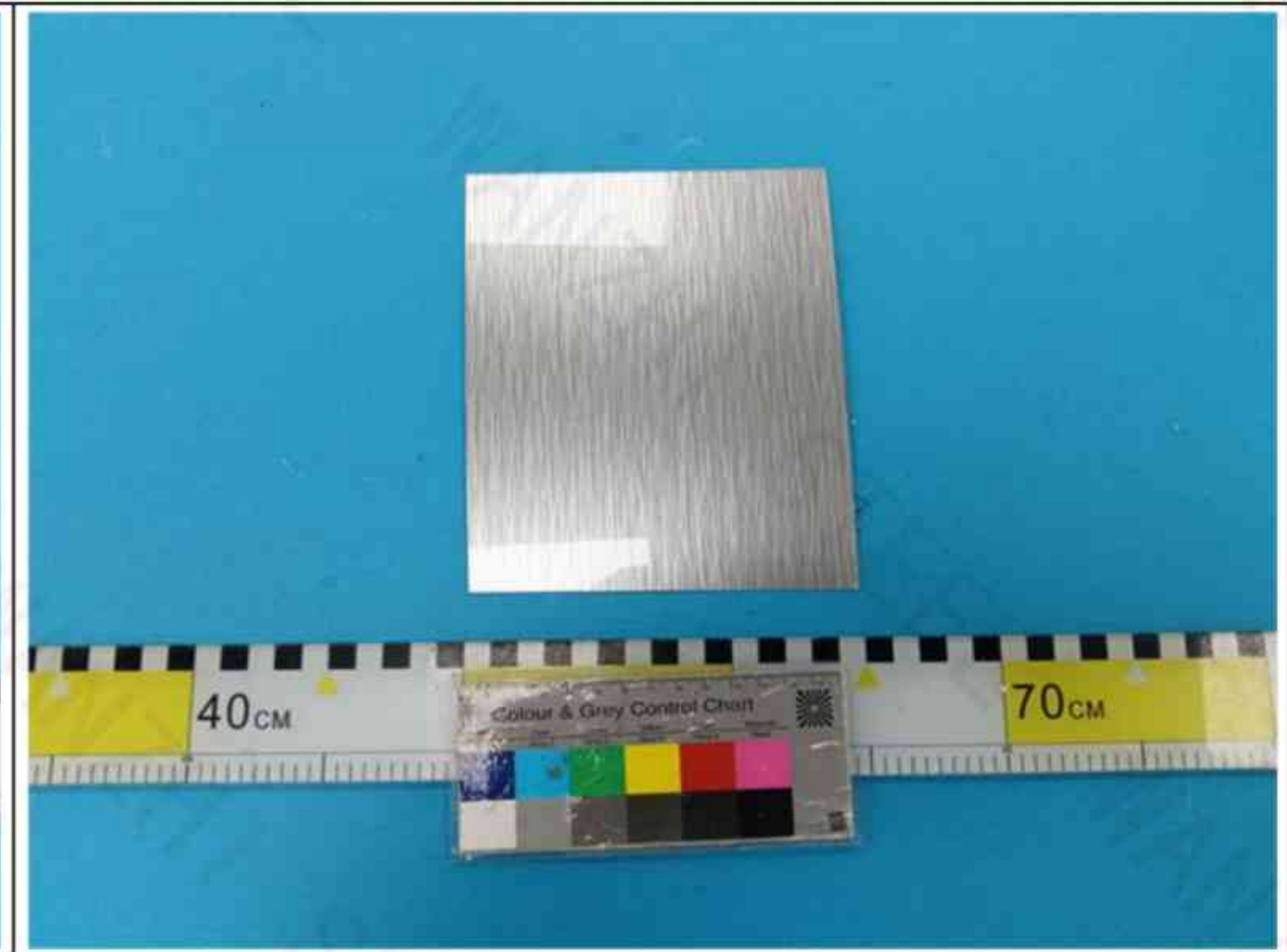
Before Test-Sample C